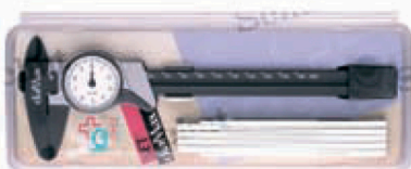
837.209: set with folding rule of 1 m