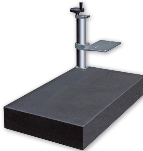
Granite base with measuring support for RUGOSURF 90G with manual vertical positioning device