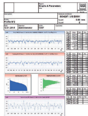
Measuring report with customisable header and logo