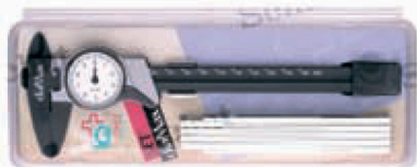
837.209: set with folding rule of 1 m